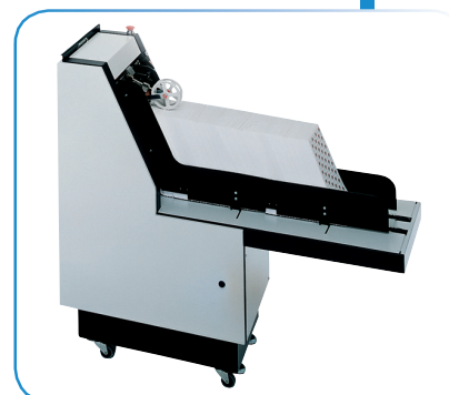
FD 2000-60 Bulk Input Loader (optional for FD 2094)