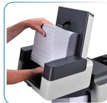
High-Capacity Vertical Output Stacker