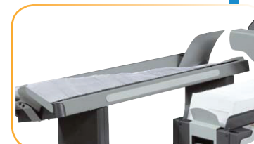
Optional High-Capacity Envelope Hopper and Output Conveyor - Each can hold up to 1,000 envelopes

Formax - New Hampshire, USA www.formax.com