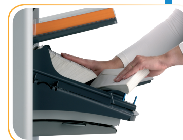
Optional Production Feeder