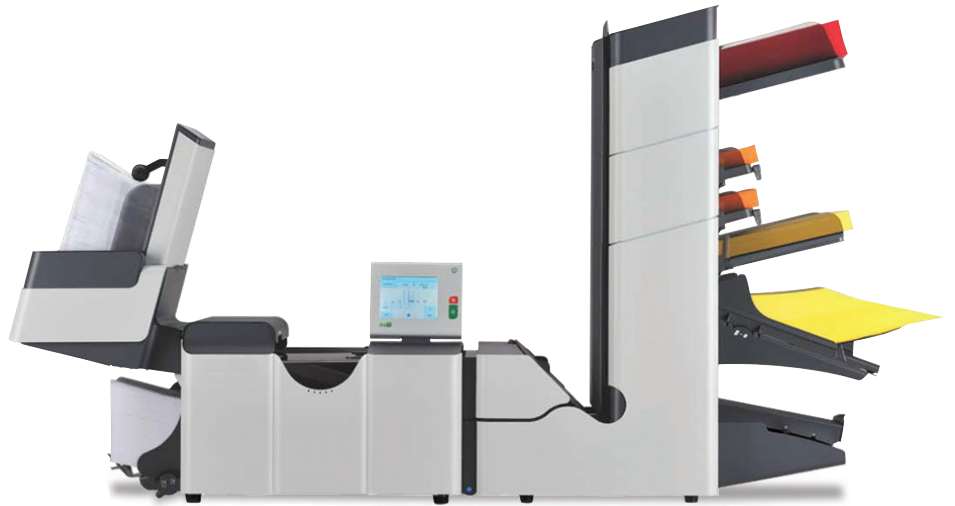
6404 Series, shown with High-Capacity Document Feeder, optional Short Feed Trays, and optional High-Capacity Production Feeder