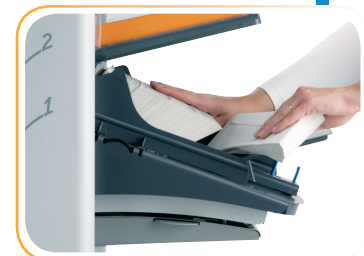
Optional Production Feeder holds up to 325 BREs

Formax - New Hampshire, USA www.formax.com