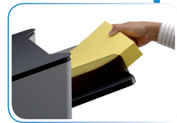
High-capacity Document Feeder holds up to 725 sheets and multi-page sets