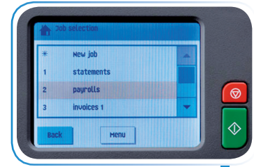
User-friendly full-color touchscreen control panel

* Paper & envelope specifications may vary. All media must be tested.