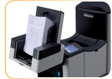
High-capacity Vertical Stacker holds up to 500 filled envelopes