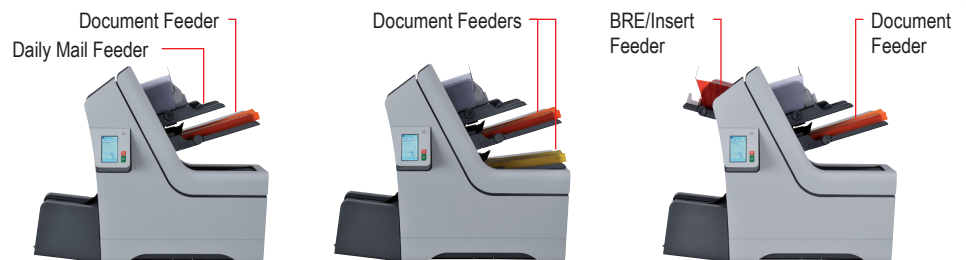
6206-Basic 1 One Document Feeder

OMR/BCR are available options, and the 6206 Series has advanced scanning capabilities to read codes printed horizontally or vertically, anywhere on the page.