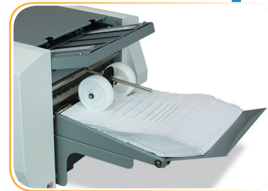
Integrated Output Conveyor

The FD 1502 Plus is built with proven Formax technology. Heavy-duty steel construction offers the dependability and power expected of a larger unit in a smaller package. A hopper capacity of up to 200 forms and processing speed of up to 6,250 forms per hour enables an operator to complete daily jobs in no time. Plus, the integrated output conveyor keeps processed forms in a neat, sequential order.